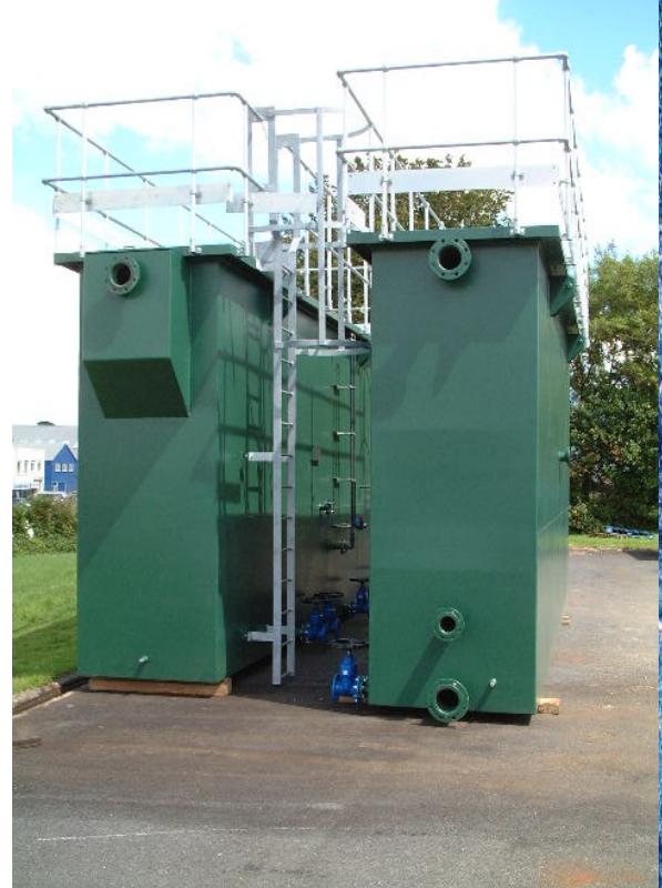
Typical Stetpack SS180 separators with inlet end seen on LH unit and outlet end on RH