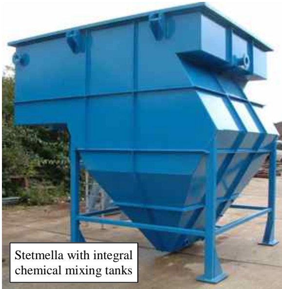
Stetmella with integral chemical mixing tanks

Units can be provided with integral coagulant and flocculent mixing tanks where additional chemical treatment of the solids particles is required.