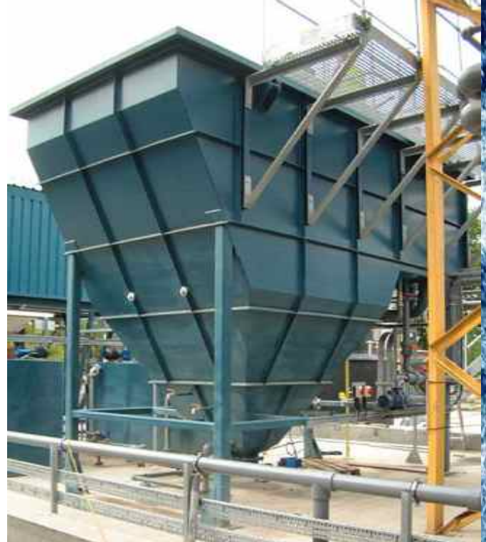
Stetmella SM75 settler with integral chemical mixing tank and clarified water discharge tank.

A range of complementary equipment is also available to facilitate installation and operation including: feed pumps, recovered sludge pumps, clarified water pumps, turbidity meters, pack removing frame and control equipment for motors and other ancillary items.