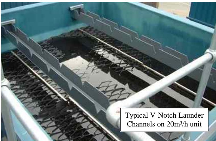
Typical V-Notch Launder Channels on 20m 3 /h unit

We can supply a full kit of parts for in-ground concrete sumps, i.e. lamella plate packs, V-notch weirs, flow distributors, support frames etc. These units can be supplied for flowrates of 1m 3 /h to 1000m 3 /h